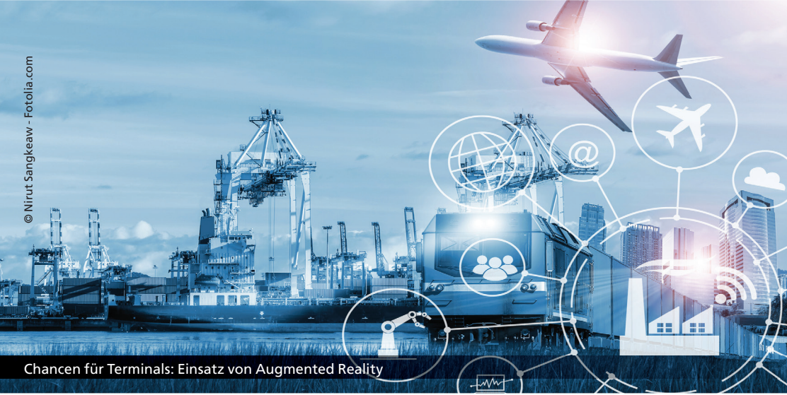
Chancen für Terminals: Einsatz von Augmented Reality